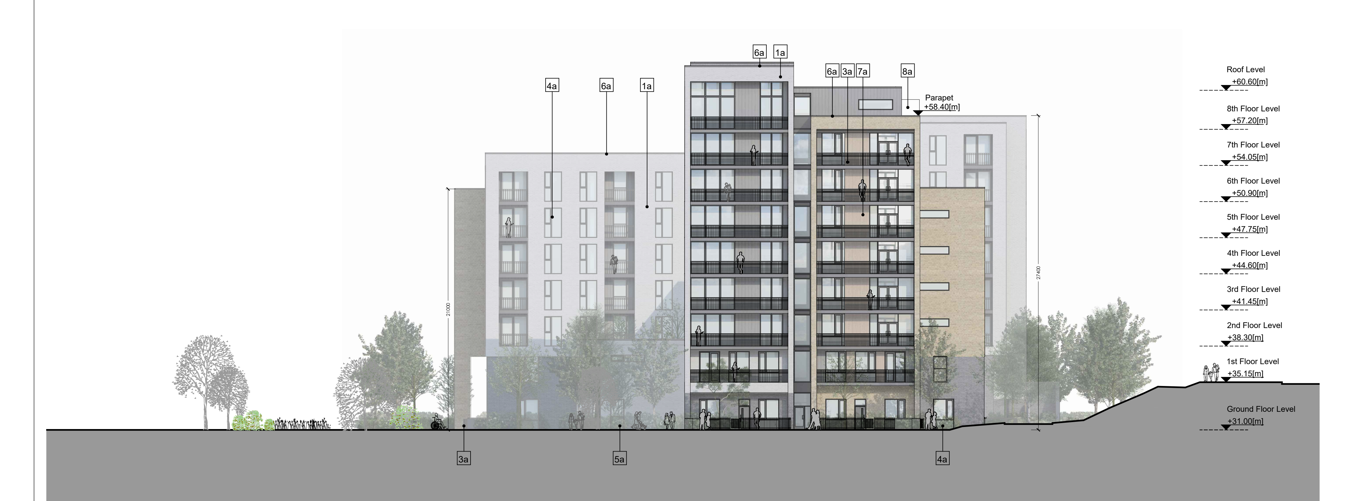
Scale 1:200 @A1